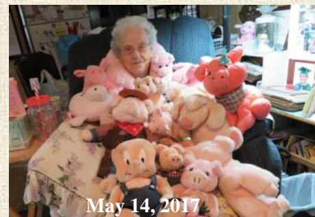
May 14, 2017