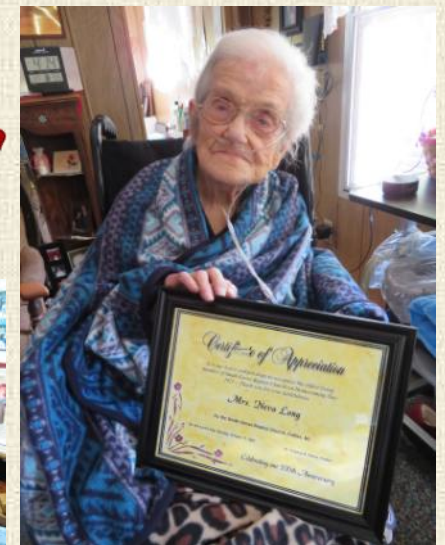
Presented on October 17, 2021