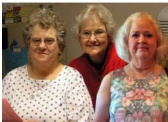
The Newsletter Committee

It's hard to realize that our beloved Messenger will be 40 years in print this year! What a blessing to realize that in this electronic age of paperless viewing, we still have our printed newsletter going into 269 physical mailboxes. Many of the people who receive our newsletter are outside our general area – even outside our