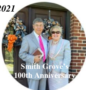
Smith Grove's 100th Anniversary