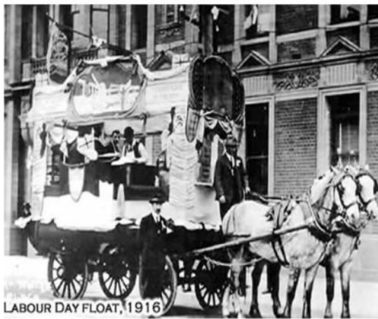
LABOUR DAY FLOAT, 1916

Federal Holiday: Labor Day became a federal holiday in 1894 when President Grover Cleveland signed a law making the first Monday in September a national holiday.